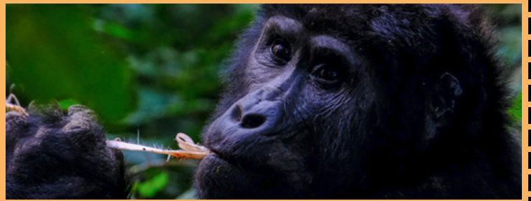
CHIMPANZEES USING STICKS TO GET TERMITES