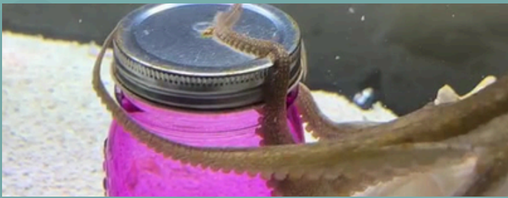
OCTOPUS OPENING A JAR TO GET FOOD