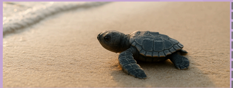
SEA TURTLES HATCHLINGS MOVING TOWARD THE OCEAN