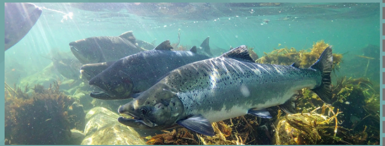
SALMON SWIMMING UPSTREAM TO SPAWN