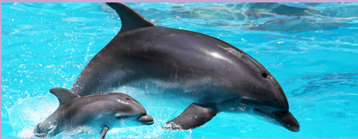
DOLPHINS TEACHING HUNTING STRATEGIES