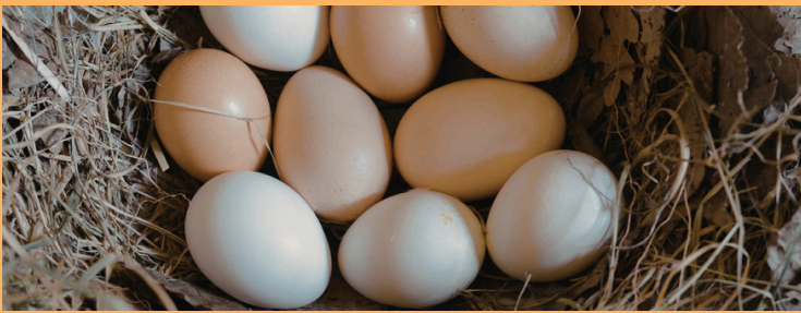
BIRDS LAYING EGGS