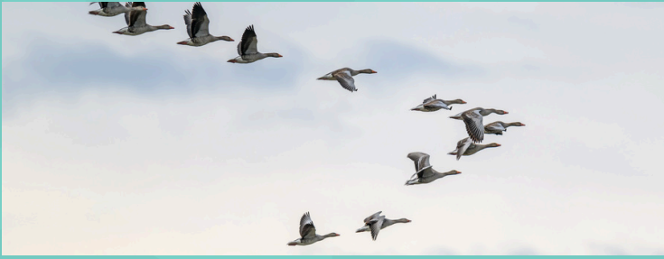
GEESE FLYING SOUTH FOR WINTER