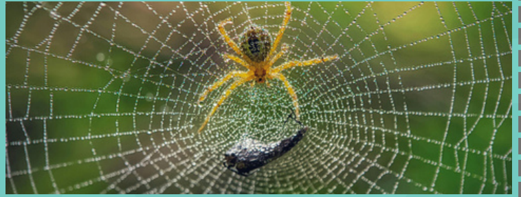
SPIDERS SPINNING WEBS