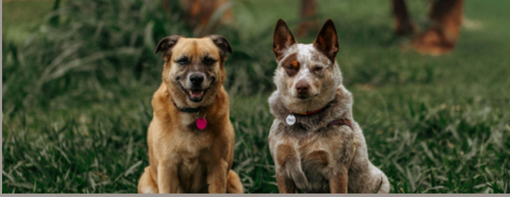
DOGS FOLLOWING COMMANDS