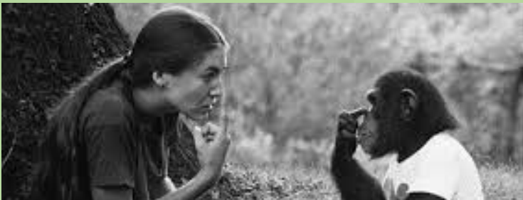
GORILLAS USING SIGN LANGUAGE TO COMMUNICATE